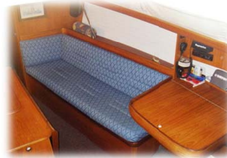
Αυθεντικές φωτογραφίες του σκάφους